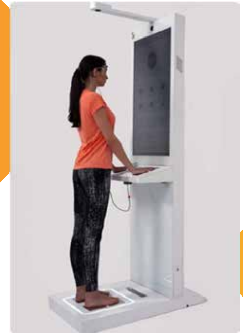
MenlaScan Pro Kiosk